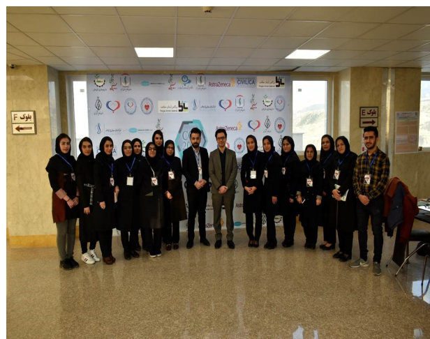
Figure 4. The Organizing Committee of the congress, CCR3 2019.

of Medicine, Alborz University of Medical Sciences, Iran) (Figure 2). In the current conference, over 1000 researchers from different parts of Iran came together to present the latest advances and transformative discoveries in the medical sciences (Figure 3). Highlights of this meeting included plenary lectures from top national scientists and the recognition of the reports of leading and junior scientists with some top awards such as the Clinical Research Development Unit (CRDU) award for excellence in case reports, the young presenter award, etc.