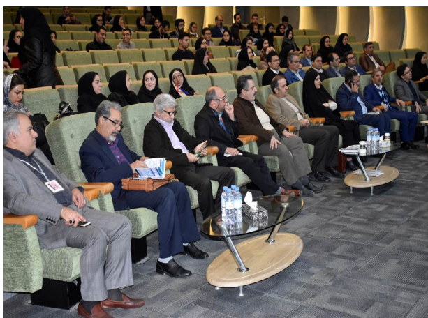
Figure 3. The Participants of the congress, CCR3 2019.