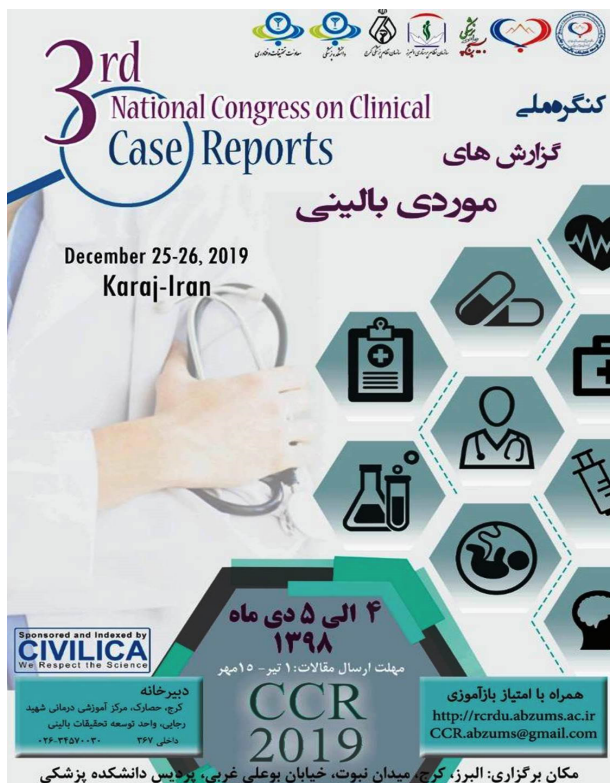
Figure 1. Poster Announcing the 3rd National Congress on Clinical Case Reports, Iran.