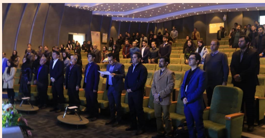
Figure 3. The Opening Ceremony of the Congress.