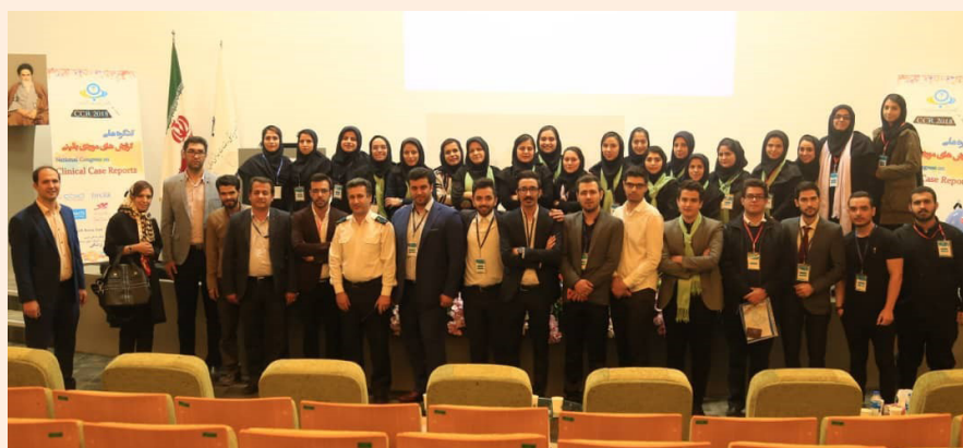
Figure 2. The Organizing Committee of the 2 nd National Congress on Clinical Case Reports of Iran (CCR 2018)